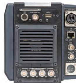
Rear panel of UHL-43 with optional 12G-OPT and Quadlink

Design and specifications are subject to change without notice.