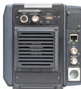
Rear panel of UHL-43(standard)