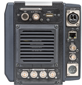
Rear panel of UHL-43 with optional 12G-OPT and Quadlink

Design and specifications are subject to change without notice.