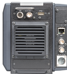
Rear panel of UHL-43(standard)