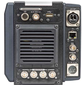
Rear panel of UHL-43 with optional 12G-OPT and Quadlink

Design and specifications are subject to change without notice.