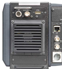
Rear panel of UHL-43(standard)