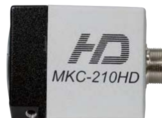
Camera Head (Actual Size)