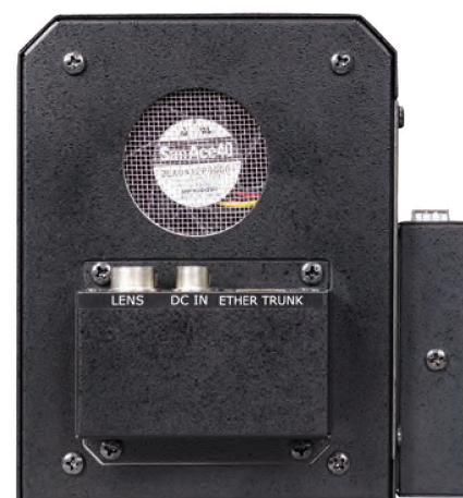
Rear Panel for Camera Head