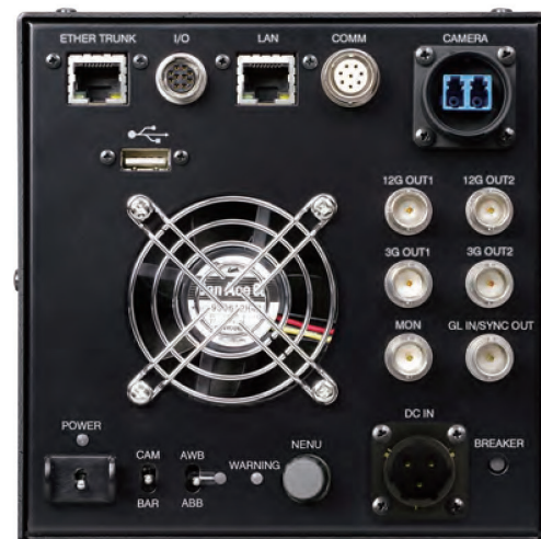
Rear Panel for CCU